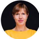
Kersti Kaljulaid Global Advocate of the UN Secretary-General for Every Woman Every Child; Former President of the Republic of Estonia