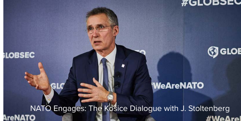
NATO Engages: The Kosice Dialogue with J. Stoltenberg