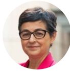
Arancha González Laya Dean of Paris School of International Affairs at Sciences Po, France; Former Minister of Foreign Affairs, European Union and Cooperation of the Kingdom of Spain