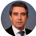
Rosen Plevneliev Former President of the Republic of Bulgaria