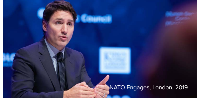
NATO Engages, London, 2019