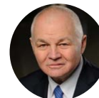
Jan Krzysztof Bielecki

Executive Vice President of the Atlantic Council, Former CEO and President of the Truman National Security Project and the Truman Center for National Policy