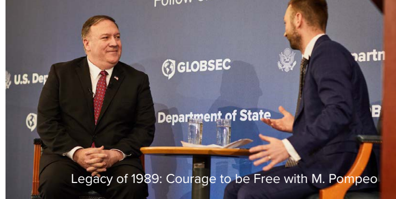
Legacy of 1989: Courage to be Free with M. Pompeo