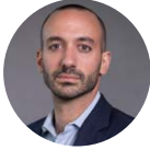
Benjamin Haddad Deputy for the 14th District of Paris, National Assembly of the French Republic