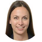
Eva Maydell Member of the European Parliament