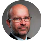
Rastislav Káčer Former Minister of Foreign and European Affairs of the Slovak Republic