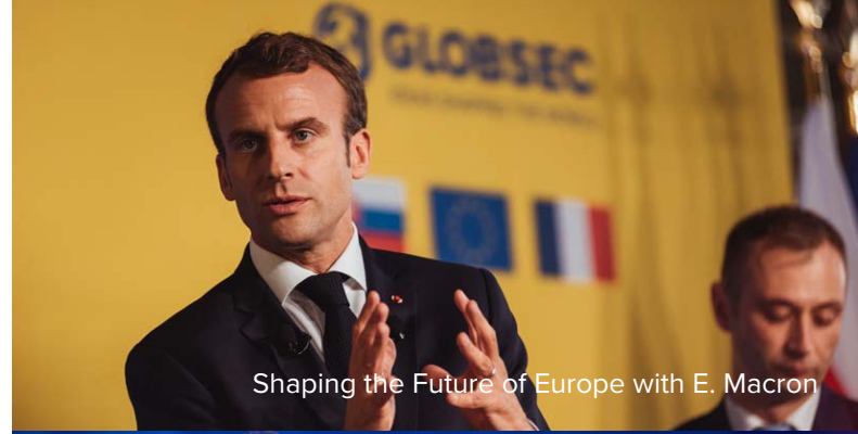
Shaping the Future of Europe with E. Macron