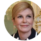
Kolinda Grabar-Kitarović Fourth President of the Republic of Croatia