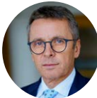
Ivan Mikloš Former Deputy Prime Minister and Minister of Finance of the Slovak Republic