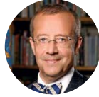
Toomas Hendrik Ilves Former President of the Republic of Estonia