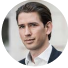
Sebastian Kurz Former Chancellor of the Federal Republic of Austria; CEO, SK Management