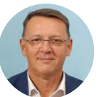
Anton rop Former Prime Minister of the Republic of Slovenia and Honorary Vice-President of EIB