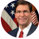
Mark T. Esper 27th U.S. Secretary of Defense