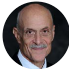
Michael Chertoff Co-founder and Executive Chairman, The Chertoff Group, United States of America; Former Secretary of the U.S. Department of Homeland Security