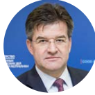
Miroslav Lajčák EU Special Representative for the Belgrade-Pristina Dialogue and Regional Issues; Former Minister of Foreign and European Affairs of the Slovak Republic